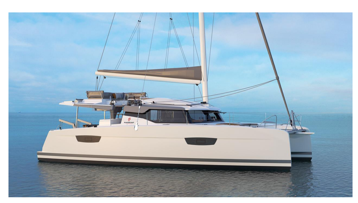
Non contractual image. Illustrations may feature optional equipment available at additional cost.